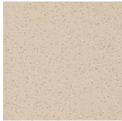
Mocha 6249 w/r 5212 NCS S 3005-Y20R LRV 43