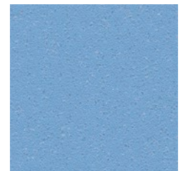
Azure 6255 w/r 5206 NCS S 3030-R90B LRV 31