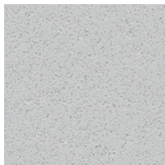
Glacier 6241 w/r 5202 NCS S 2502-B LRV 47