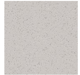
Rock Salt 6251 w/r 9858 NCS S 3000-N LRV 43