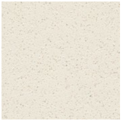
Vanilla 6253 w/r 5221 NCS S 1502-Y LRV 63