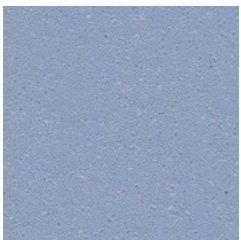
Pacific Blue 6244 w/r 5208 NCS S 3020-R90B LRV 29