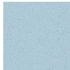
Sea Breeze 6254 w/r 5205 NCS S 2020-B LRV 44