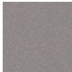
Pebble Shore 6250 w/r 5233 NCS S 5500-N LRV 21