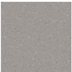
Monsoon 6248 w/r 5764 NCS S 4500-N LRV 25