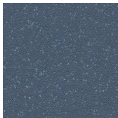
Midnight Blue 6245 w/r 5207 NCS S 6010-R90B LRV 12