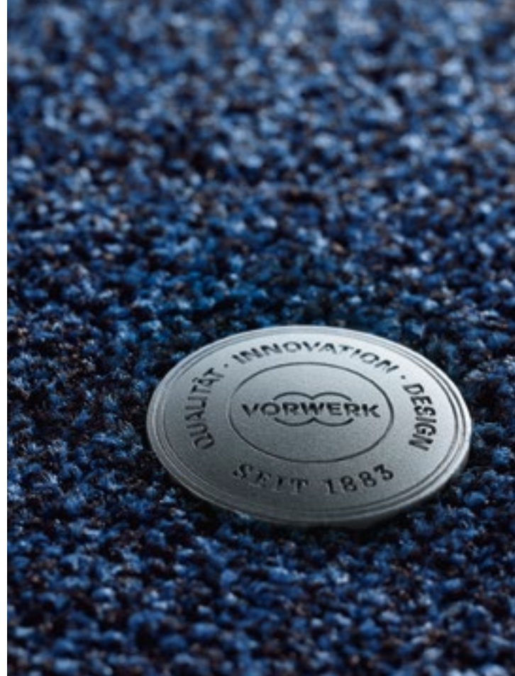
Superior 1012, 372Z