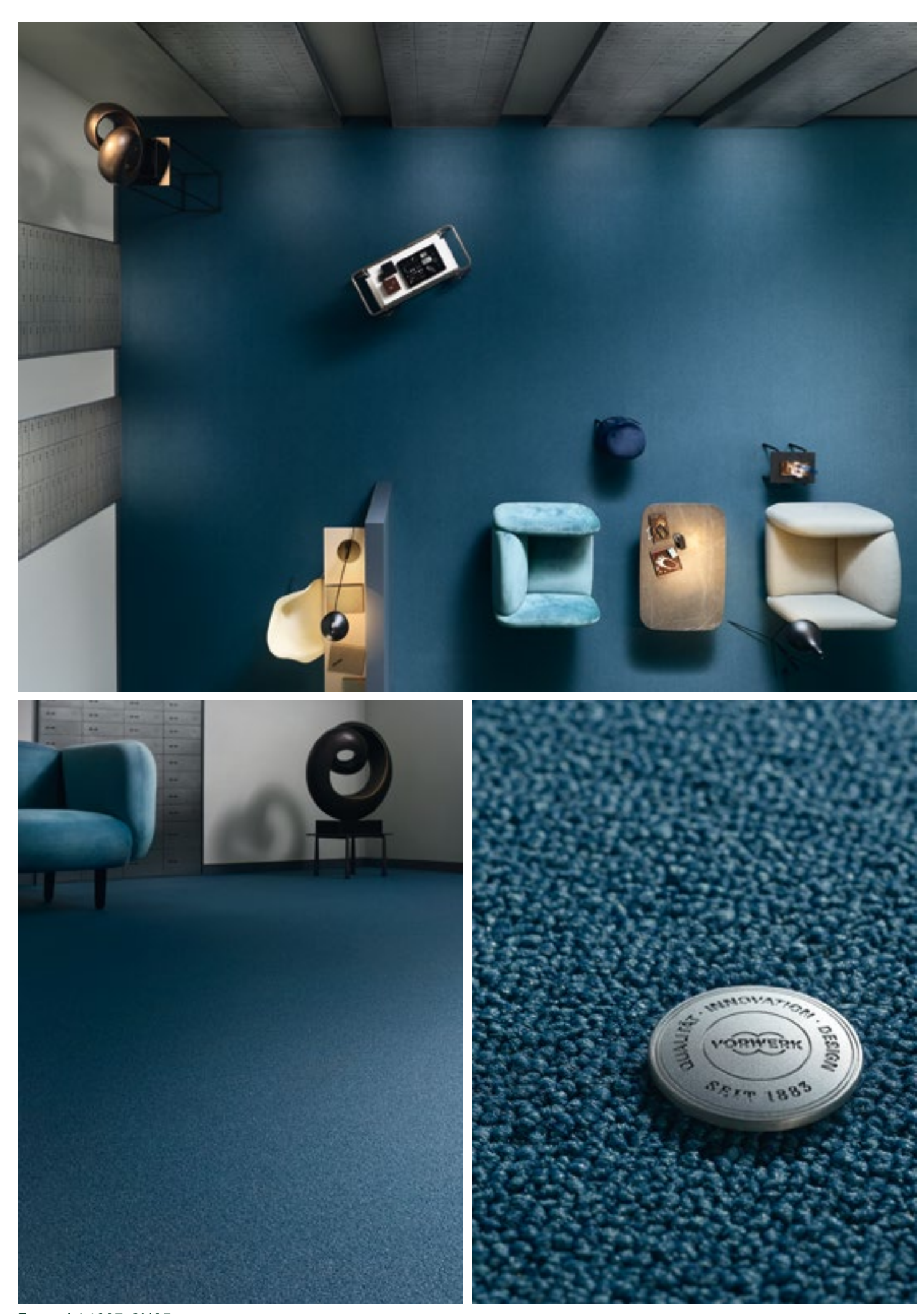
Essential 1027, 3N95