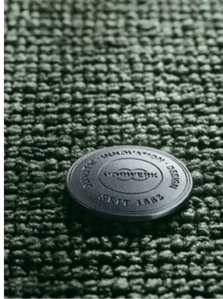
Essential 1031, 4G29