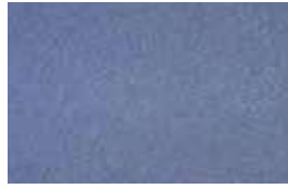
Workspace Entrance Viscount