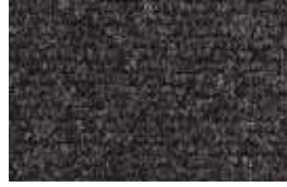
MW Rib Anthracite