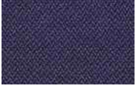
Premier Dark Blue