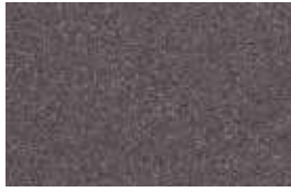
Workspace Entrance Victor