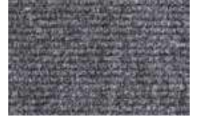
MW Rib Light Grey