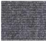
MW Rib HD Light Grey