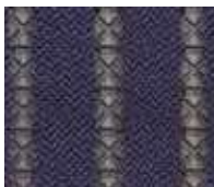
Premier Dark Blue