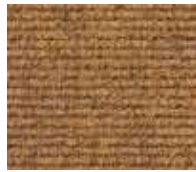
MW Rib HD Natural