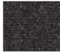
MW Rib HD Anthracite