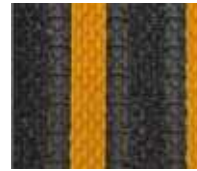
MW Maxim Yellow and MW Maxim Anthracite (Safety Colour Inserts)