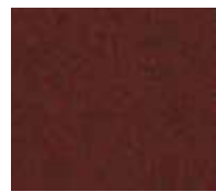
Workspace Entrance Vixen