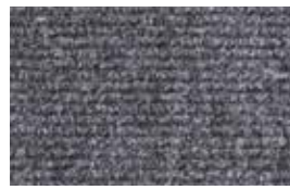
MW Rib HD Light Grey