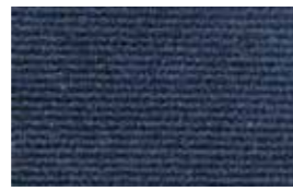
MW Rib HD Deep Blue