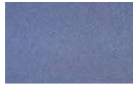
Workspace Entrance Viscount