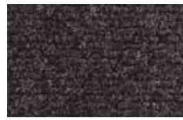
MW Rib HD Anthracite