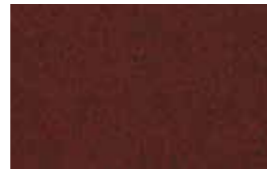
Workspace Entrance Vixen