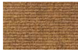
MW Rib HD Natural