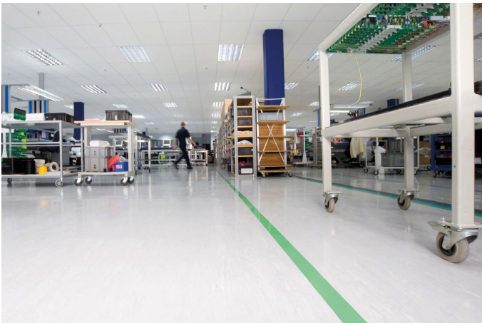
Example of a use area - Polyflor SD

Polyflor SD is a heavy-duty homogeneous flooring suitable for heavy traffic areas where electrostatic control is critical within the demanding healthcare sector, education, commercial and industrial applications in a broad range of colours. These 2.0mm products are use classified at 34, 43 according to ISO 10874.